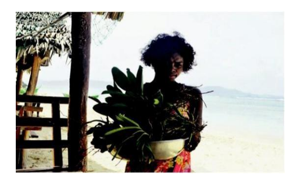
Economic Activities and Sources of Livelihood

Aside from using —Ilocanol language they also have their own language, but nobody knows or understands it. Lowlanders often look down on them, who have lived in the upland areas. Because of this, they are sometimes considered as uncivilized having bad manners, ugly and ignorant. Because of this discrimination, they have often tried to blend into contemporary society, in the process of losing their own identity.